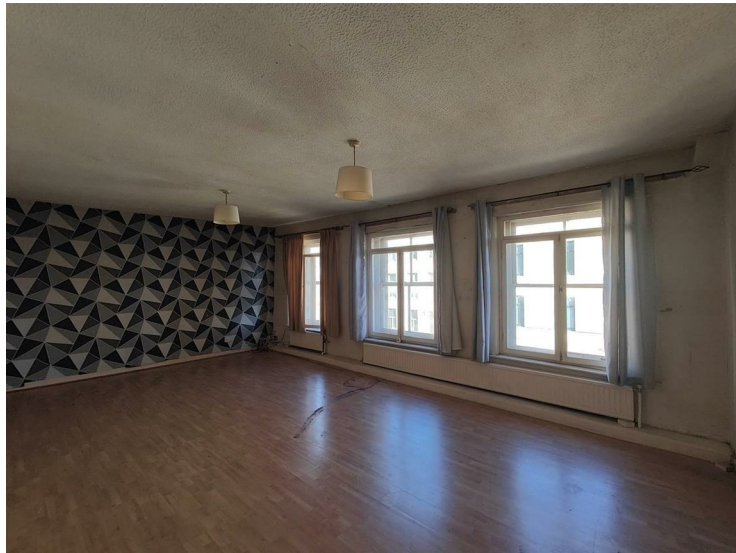
Lounge 21'3" x 12'8" (6.5 x 3.88)