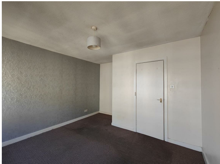
Bedroom 10'7" x 12'0" (3.24 x 3.66)