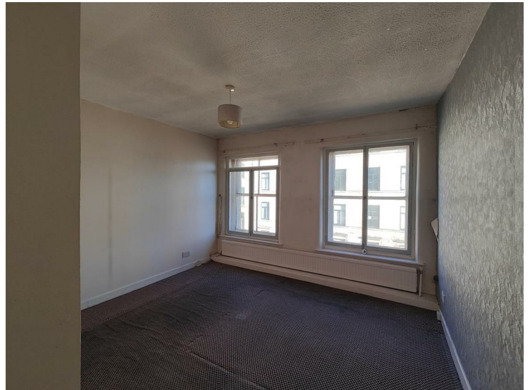
Bedroom angle 2